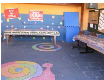
Social Centre CRAS