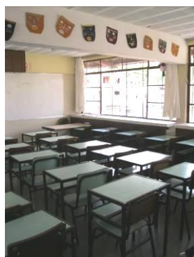
Hugo Werneck school