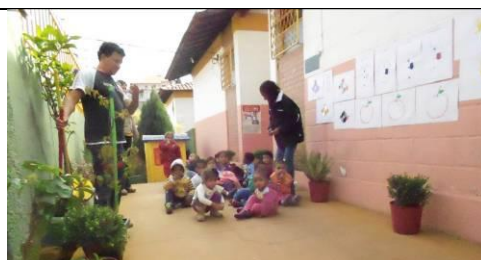
Some images of the Infanto Juvenil "Crescer Sorrindo" Centre