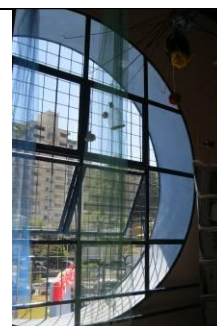
Some images of the UMEI Silvia Lobo