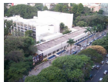
Palace of Arts

After the meeting of the coordinators of the EDUCA project, which took place in Reggio Emilia in December 2011, a group of work has developed in BH, which is dedicated to the project itself. The group is made of: