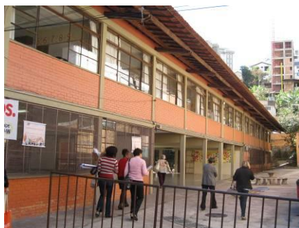
Scuola Hugo Wernek