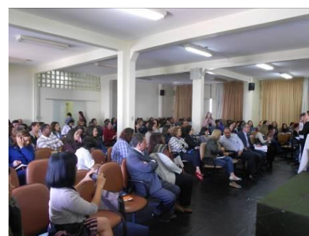
Apertura del Forum