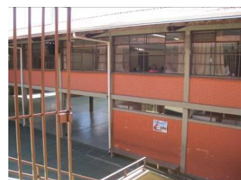
Drumond Primary school